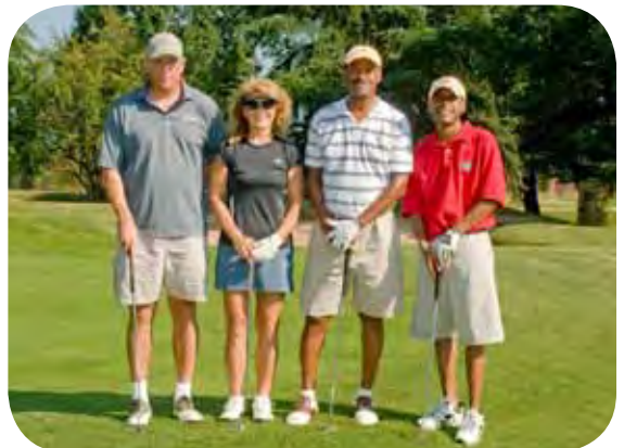
First Community Bank Golf Team

Special Sponsors ACS Benefit Services, Inc. Bonfish Grill Chick-fil-A Dental Center of the Carolinas Graylyn Inn International Conference Center Lexington Memorial Hospital Pfaff's Glass Specialized Fitness, Inc. Sports Flooring Group